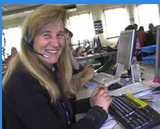
Flybe Reservations, Exeter Airport

The aim of this CD is to focus on people based right here in the South West, engaged in a variety of jobs and using a foreign language at different levels. The end product will be made available to schools to use as they wish.