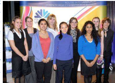
Launch of Routes into Languages, London, 5 February 2008